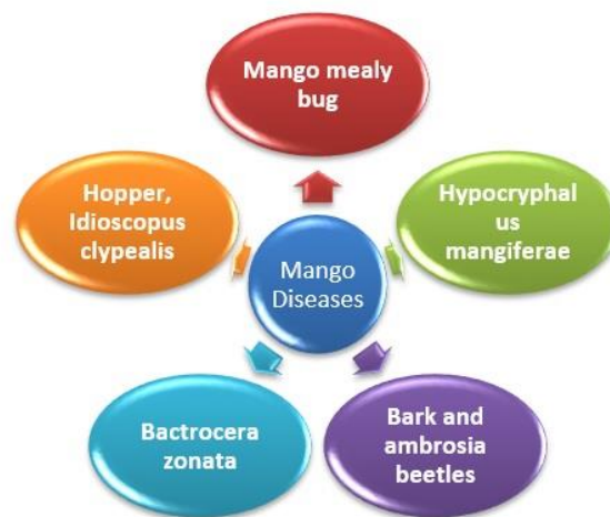
Figure 1. Diseases and toxicity due to different pests in Mango

One of Pakistan's most significant fruit crops and a major source of foreign cash is the mango, Mangifera indica L, a member of the